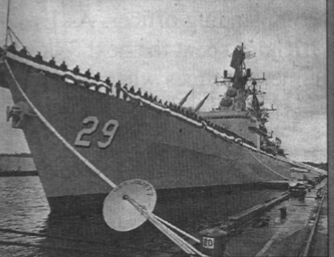
U.S.S. Jouett (DLG29)