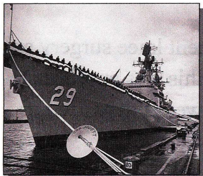
U.S.S. Jouett (DLG29) Commissioning Day