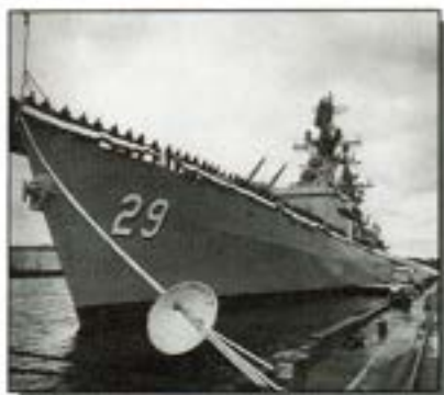
U.S.S. Jouett (DLG29) Commissioning Day